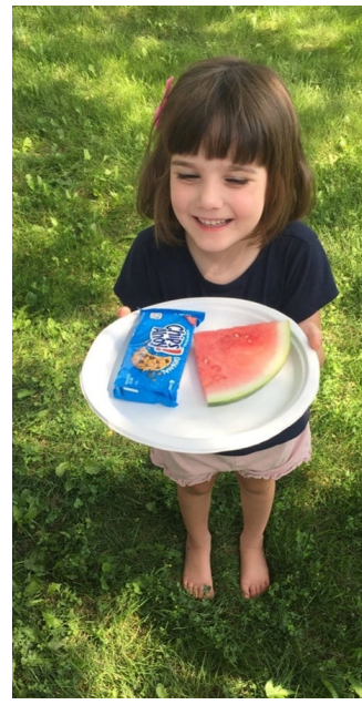
For more photos on both of these events, see page 6 or visit St. David's Facebook page:

https://www.facebook.com/groups/stdavids south field/\\ media