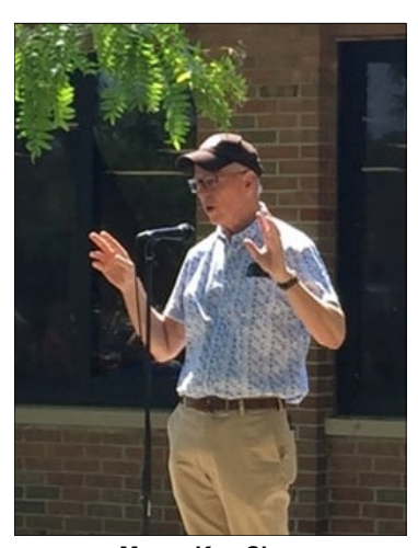
Mayor Ken Siver City of Southfield